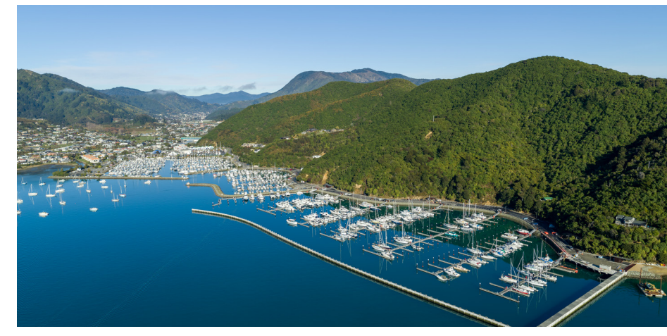
The new Waikawa Marina

For more information go to: www.marlboroughmarinas.co.nz