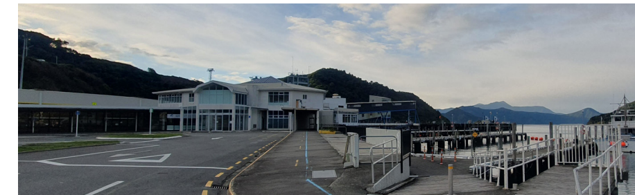
The demolition of the Picton ferry terminal will clear the site for future port operations