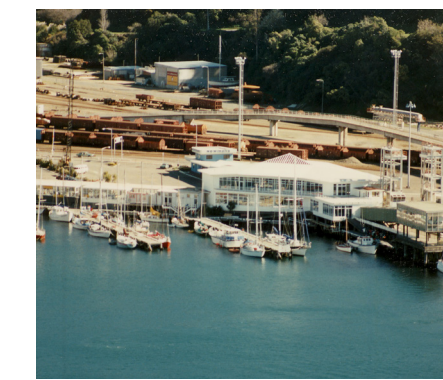
The Picton ferry terminal soon after it was built in the 1960s

"The demolition of the terminal building will now clear the site for future port operations and Port Marlborough continues to work closely with government agencies on the next steps for development. The works are being managed carefully to ensure continued service efficiency and safety for our busy port," Mr Welbourn said.