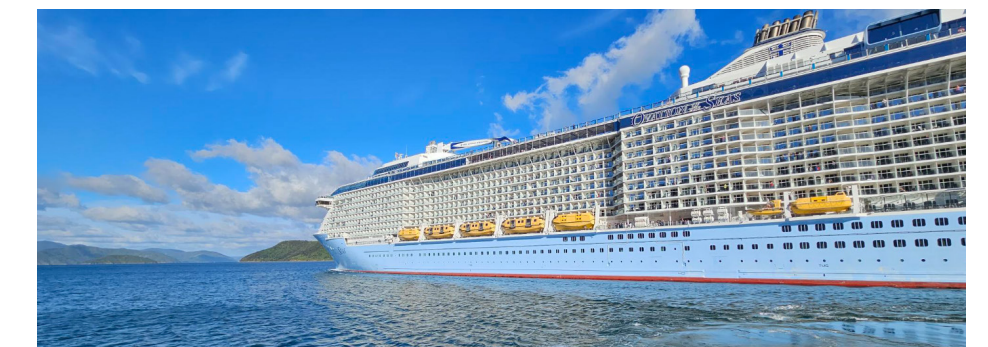
Ovation of the Seas was the largest of the ships to visit Picton this summer