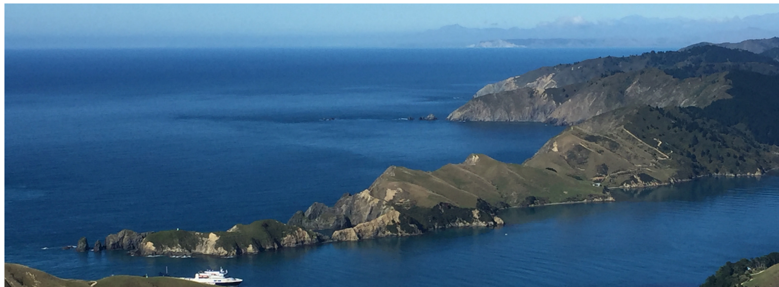
Funding for an ocean-going tugboat feasibility study has been welcomed by councils on both sides of the Cook Strait