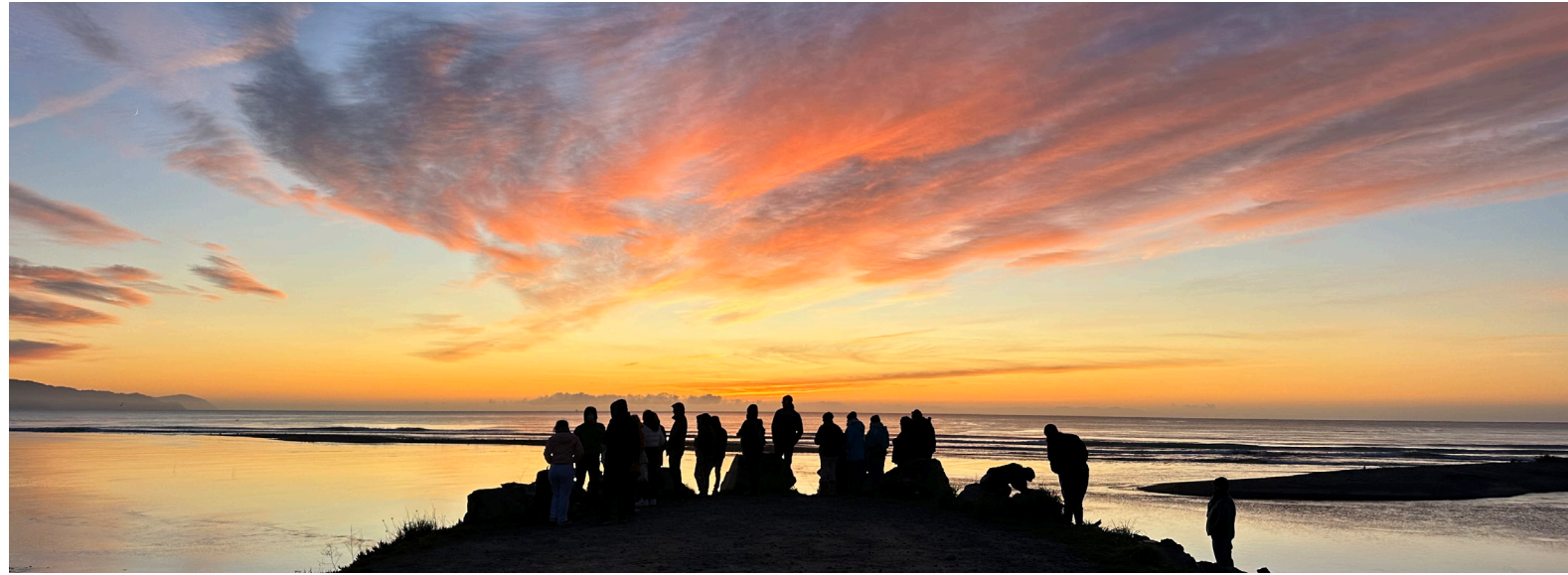
More Matariki celebrations are happening each year in Marlborough such as the Rangitāne Annual Matariki Gathering at the Wairau Bar