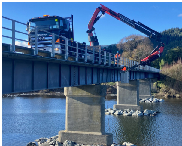
Investigation work was undertaken in May on Dalton's Bridge to inform design for the abutment repairs

The bridge was originally damaged in the August 2022 weather event. In April this year, it was closed to heavy vehicles after the Pelorus River further scoured out the bank under the bridge approach, making it potentially unsafe for vehicles over 3.5 tonne. Heavy vehicles are currently using the Te Hoiere Road detour.