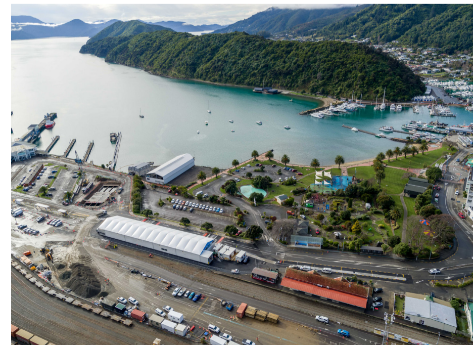
Wind up works continue in Picton as