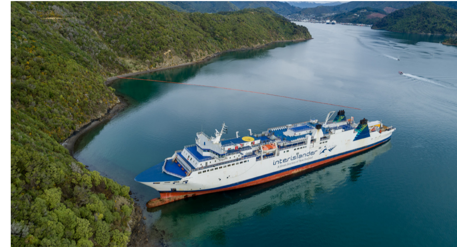
The interisland ferry Aratere aground near Bob's Bay in Picton Harbour

"This response was a team effort of professional and capable mariners and emergency responders who achieved a wonderful outcome. I'd like to thank every single person involved - you are a credit to Picton, Marlborough and New Zealand," she said.