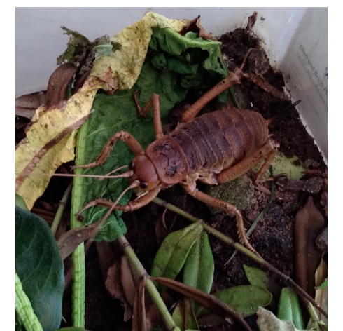
Early childhood educators got up close and personal with the giant wētā at Koru Wildlife Centre in Grovetown

"It's about facilitating relationships to give our young tamariki the opportunity to learn."