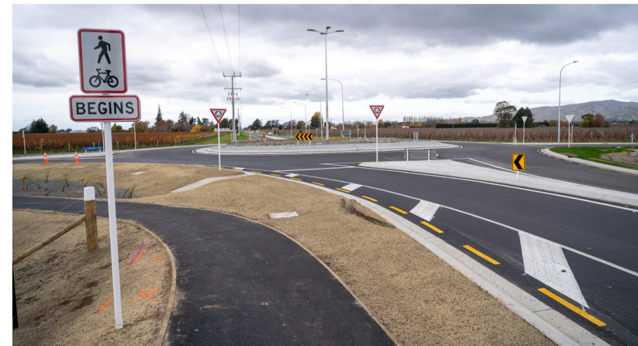
The recently completed roundabout at the SH6 Bells and St Leonards Rd intersection

During the initial works, people should plan an extra 15 minutes for their journeys and during peak times there may be longer delays.