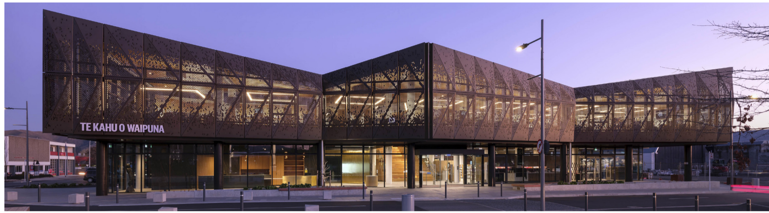
Te Kahu o Waipuna has won the public architecture category in the Te Kāhui Whaihangā New Zealand Institute of Architects Local Awards.