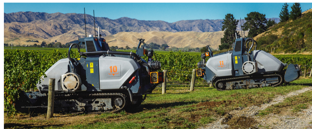
Smart Machines have won the NZTE Most Innovative Hi-Tech Agritech Solution with their revolutionary autonomous tractor

The awards are run by the NZ Hi-Tech Trust, a not-for-profit that promotes and supports the wider industry.