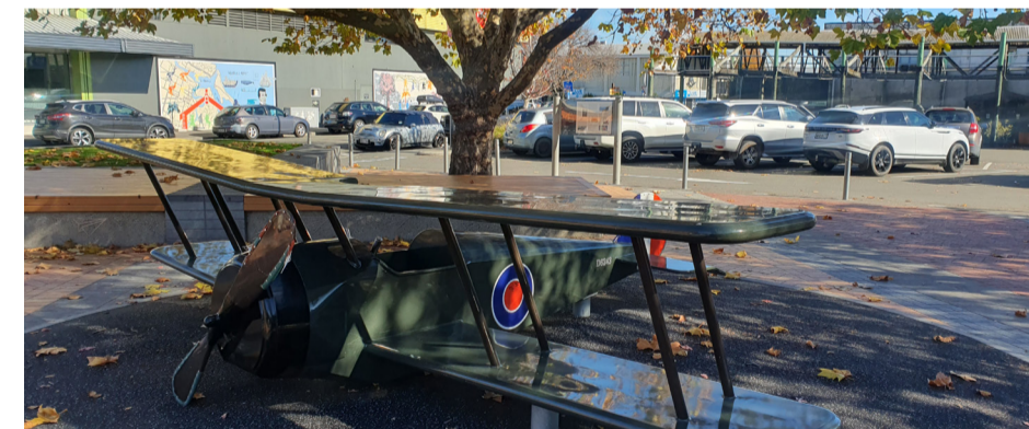
The Avro 504K takes centre stage in Liz Davidson Place

Other sites completed include the historic Echo masts at The Quays and the Tama-nui-te-rā/Sun, Earth and Moon sculpture in Adams Place.