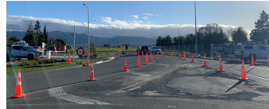
Work has begun on a new roundabout at Marlborough Airport

From 15 July, there will be a one direction (eastbound) lane closure on SH6. Detours will be in place for people travelling to or from the airport, or into Blenheim. For up-to-date information, visit the SH6 Middle Renwick Road/ Tancred Crescent Roundabout project page at: nzta.govt.nz