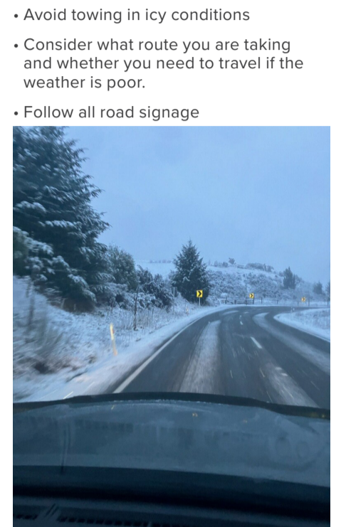
Remember to drive to the conditions this winter in Marlborough