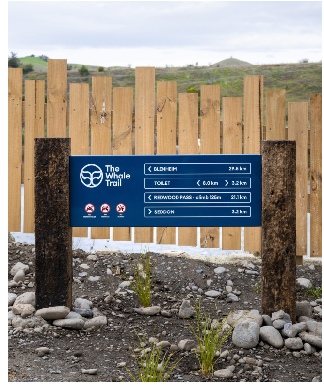
• A sign at Awatere Bridge guides walkers and riders on the Whale Trail

You can keep up to date with construction progress of the Whale Trail, thanks to a new web page.