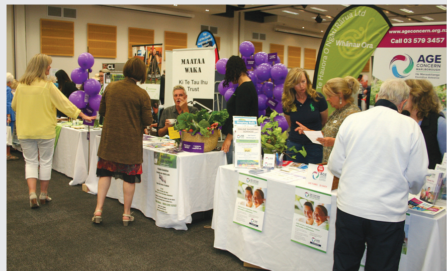
Calling all Picton seniors – you are invited to come along to an upcoming expo based on the successful Blenheim-based annual event