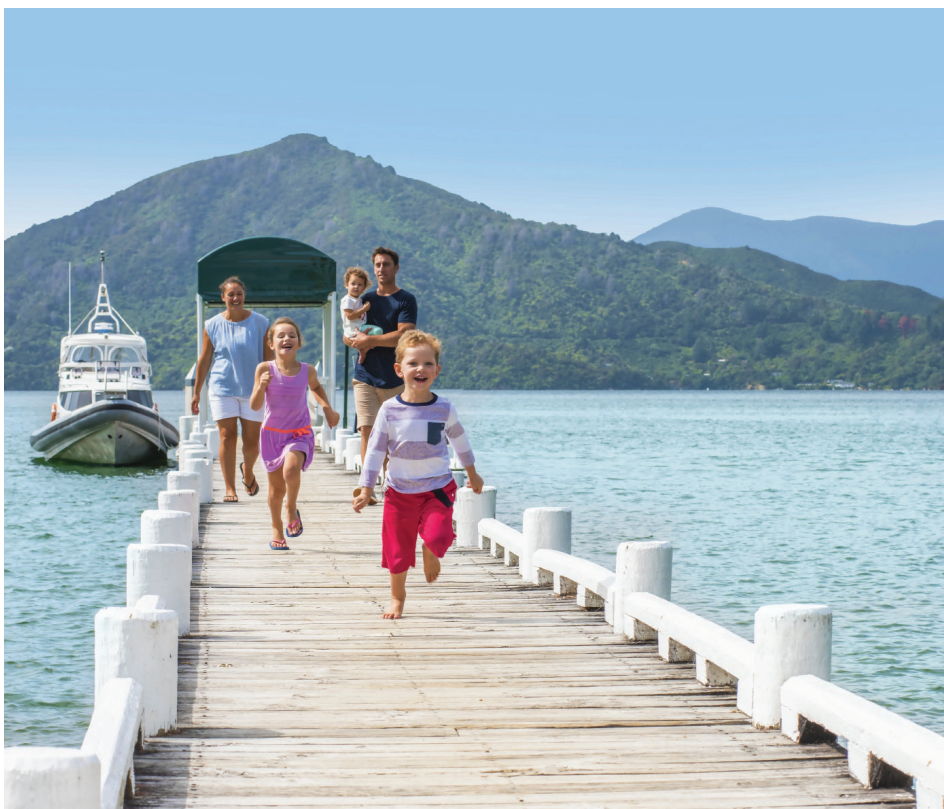
Have your say on the future of Marlborough's visitor industry support services as part of the Destination Marlborough Future Path Project

8 November 10am - 12pm Havelock Sports Pavilion