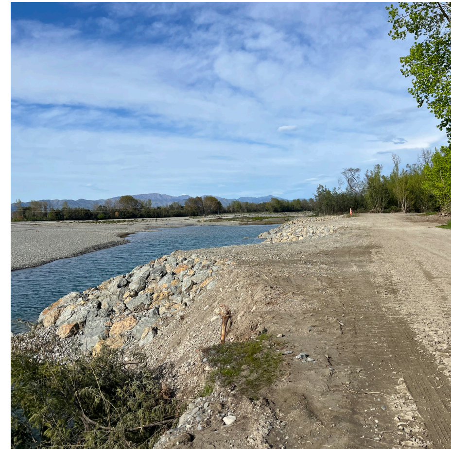
Completed groyne repairs on the Wairau River

A further 14,000 tonnes are scheduled to be in place by June 2025.