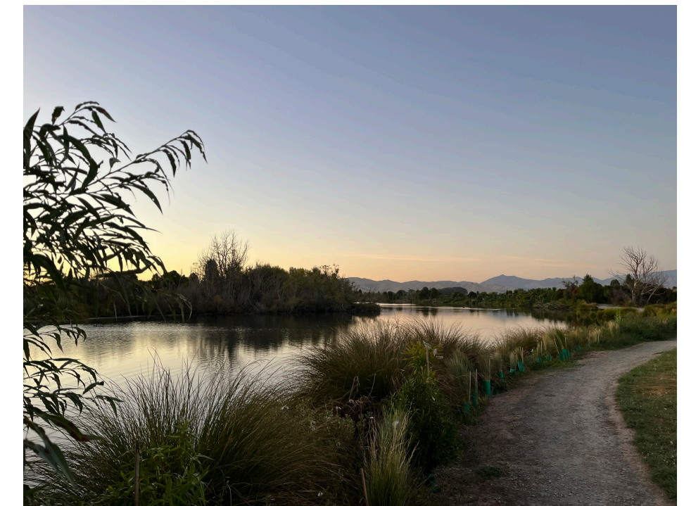
The walking track at Grovetown Lagoon, a popular spot with locals and visitors

A new management plan is currently being prepared to ensure the lagoon's protection into the future.