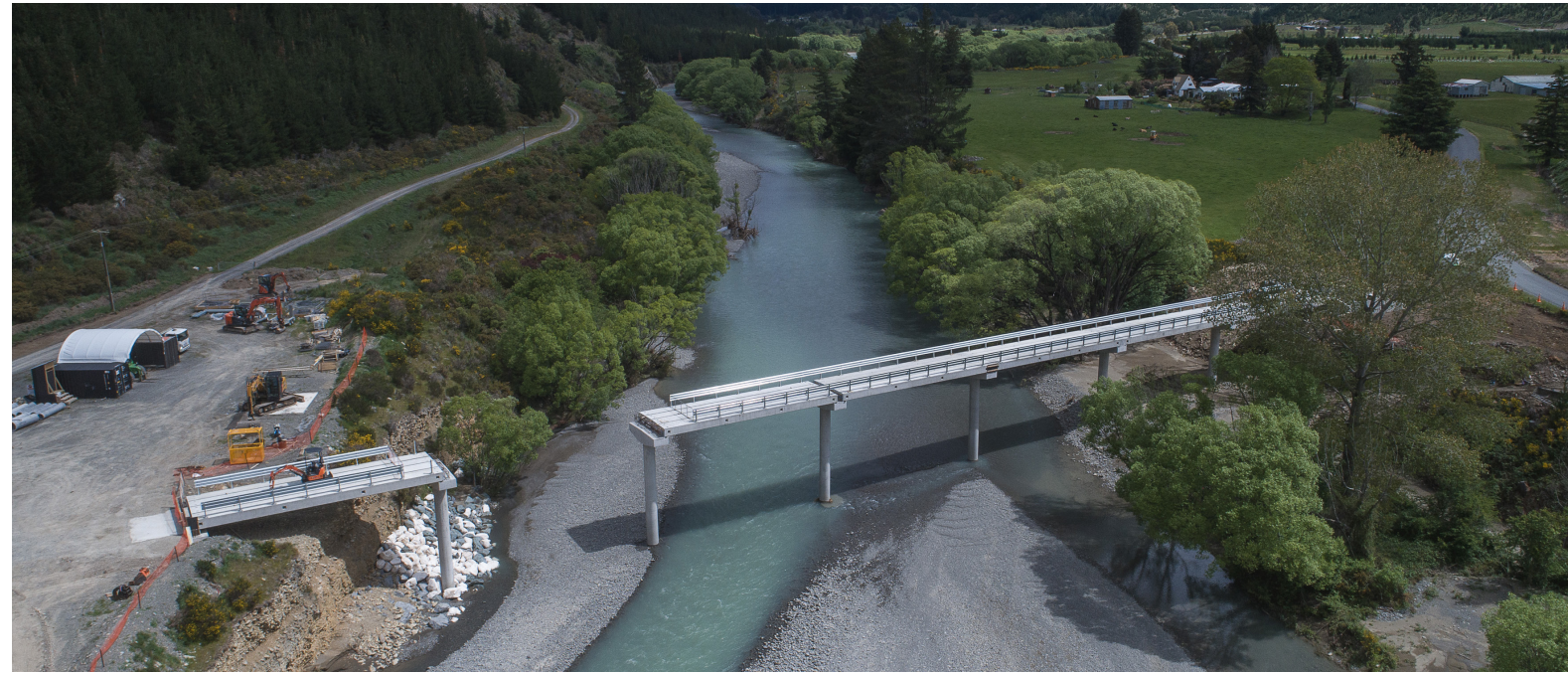
The nearly completed new bridge from the air

A new bridge is nearing completion in the Waihopai Valley.