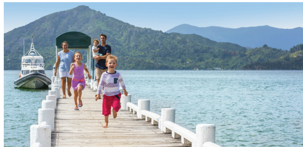
Have your say on the future of Marlborough's visitor industry support services as part of the Destination Marlborough Future Path Project

Havelock: 8 November 10am - 12pm Havelock Sports Pavilion