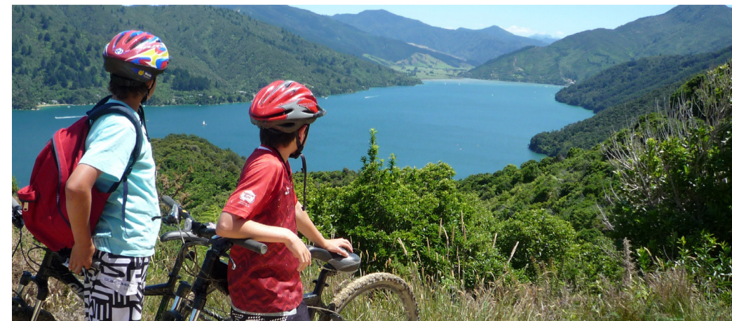
A trial to allow cyclists on all sections of the Queen Charlotte Track year-round has proved successful

Cyclists, along with walkers, also continued to be encouraged to travel north to south from Meretoto/Ship Cove to Anakiwa and DOC installed new signage in areas where there are high levels of pedestrian activities.