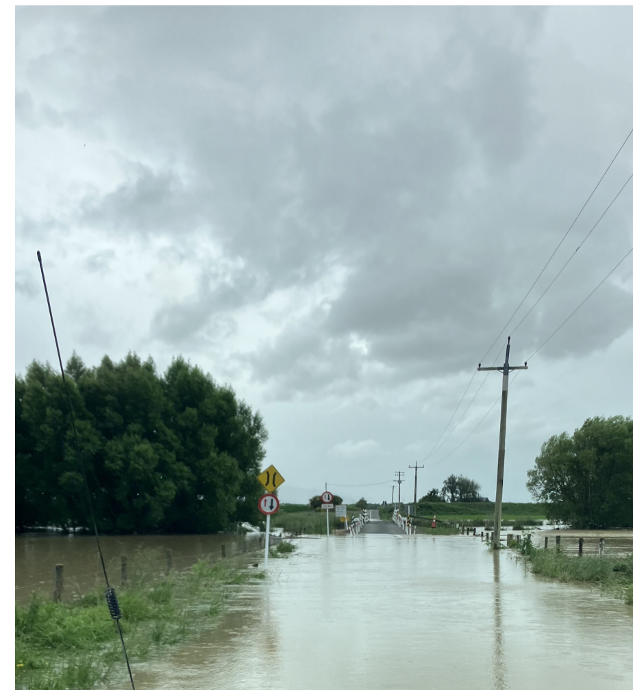
Parts of Morgans Road were completely underwater at the height of the flooding

For local roading alerts, keep an eye on Council's website or Facebook page, or download the Antenna alerting app - go to www.marlborough.govt.nz/services/apps/antenna