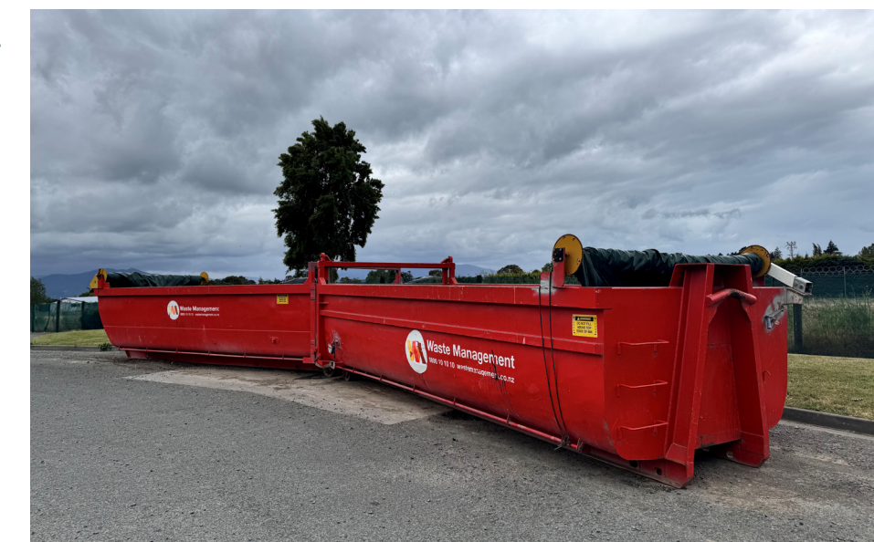
The red skip bins are being removed this weekend