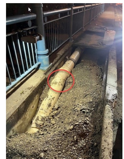
The damaged water main on the Sinclair Street bridge

The committee approved replacing the pipe with money from existing budgets.