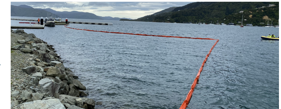
Booms in place as part of the oil spill practice at the Waikawa northwest marina