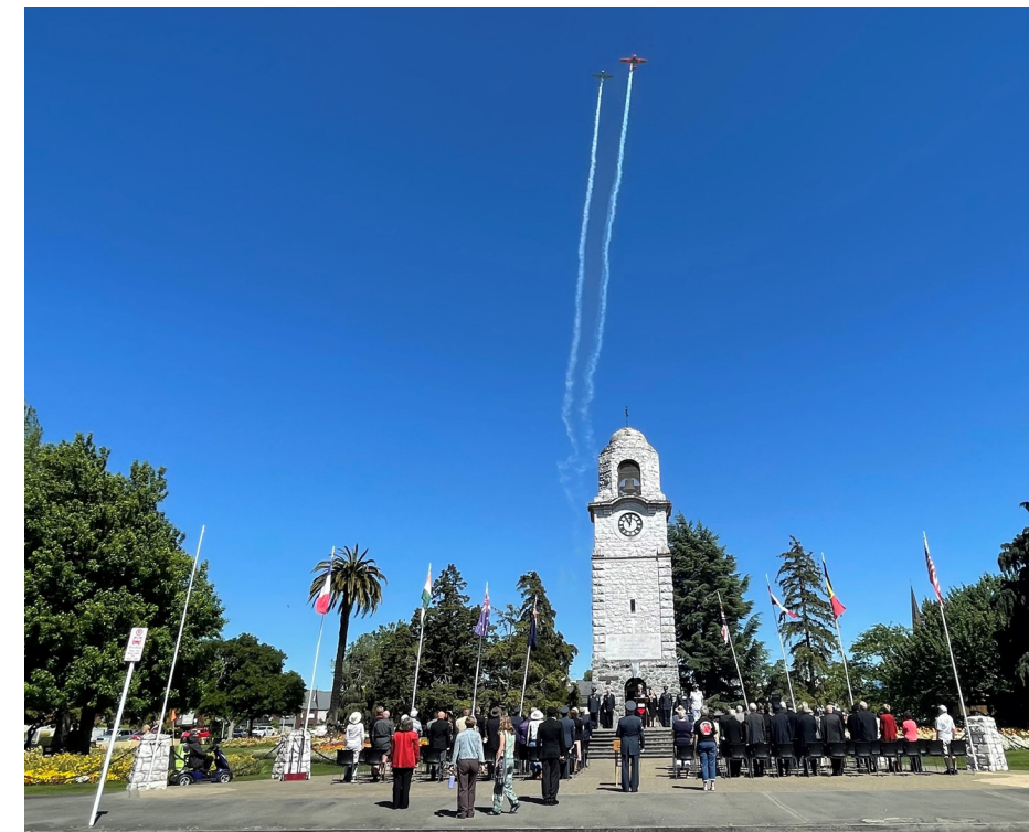
The flypast at Seymour Square on Armistice Day

The 11th hour of the 11th day of the 11th month (11am on 11 November) is when hostilities ceased on the Western Front in 1918 following the signing of the armistice.