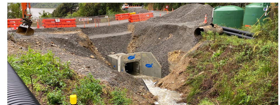
A large culvert being installed on Queen Charlotte Drive near Moenui, April 2024