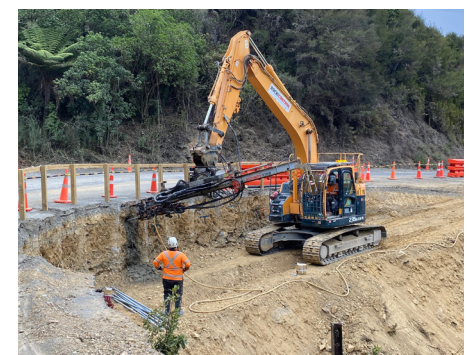
Anchor drilling near Cullen Point on Mahakipawa Hill, March 2024