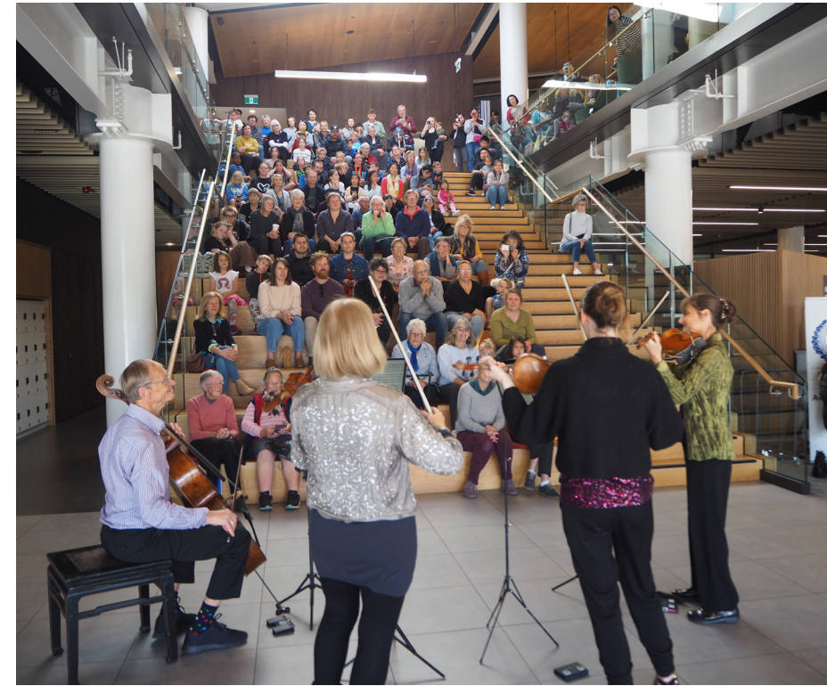
The New Zealand String Quartet performing at Te Kahu o Waipuna

Planning is currently underway to host a South American folk duo, a waiata session in conjunction with Matariki celebrations and a group of ni-Vanuatu musicians.