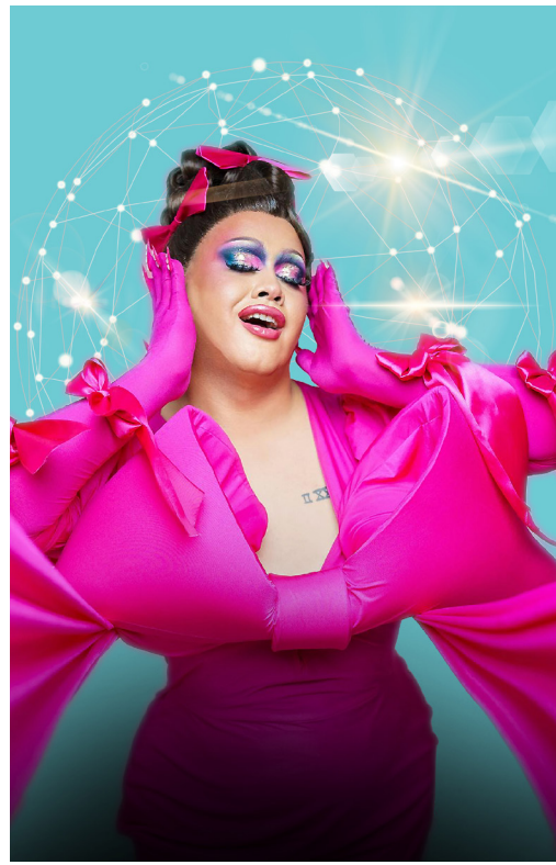
The Pride Wairau Festival is a new event on the winter calendar