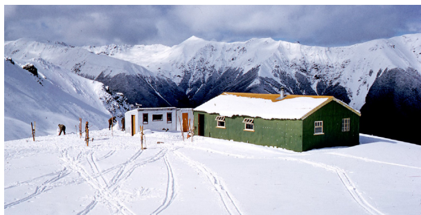
A wintry scene at Mt Robert Ski Lodge in 1955/56 - the museum is now on winter hours

To make an appointment or book a tour email: marlboroughmuseum@marlborough.govt.nz