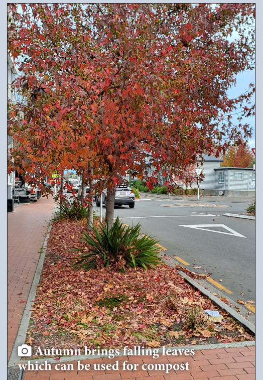
Autumn brings falling leaves which can be used for compost

Wheelie bins are being rolled out now across the region to Blenheim, Picton, Grovetown, Havelock, Rarangi, Rai Valley, Renwick, Seddon, Spring Creek and Tua Marina.