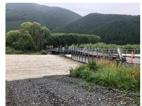
The temporary Bailey bridge