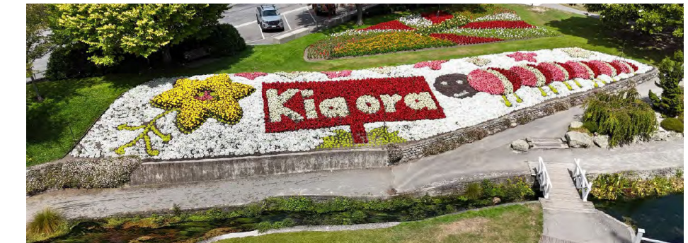
Pollard Park's display bed provides a warm welcome to park visitors

Staff have been busy with routine maintenance including dead heading roses to ensure a constant show, weeding, tidying perennial borders and the cottage gardens.