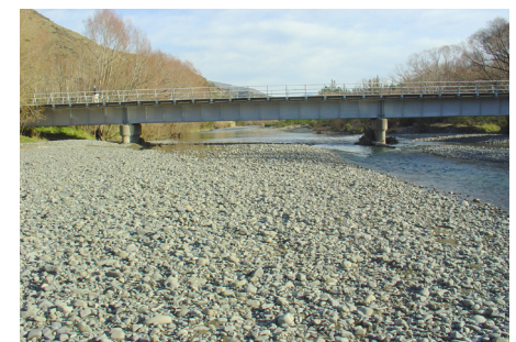
The original Waihopai Bridge