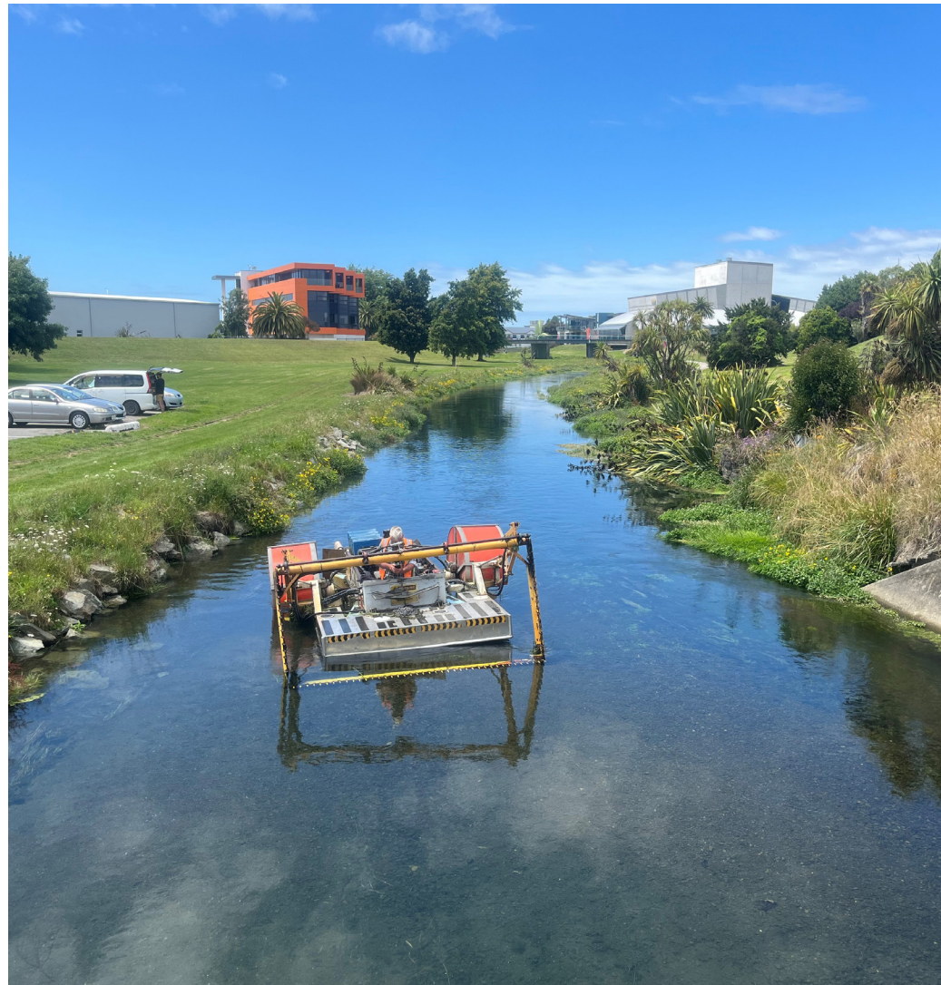
Dave Fowler on board the soon-to-be-retired River Queen weedcutting boat

Good progress has been made removing exotic river weed and dredging the Taylor River in central Blenheim.