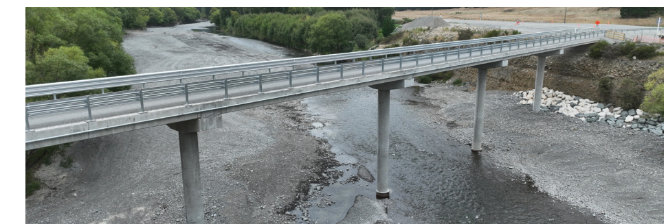
The impressive new 110m bridge