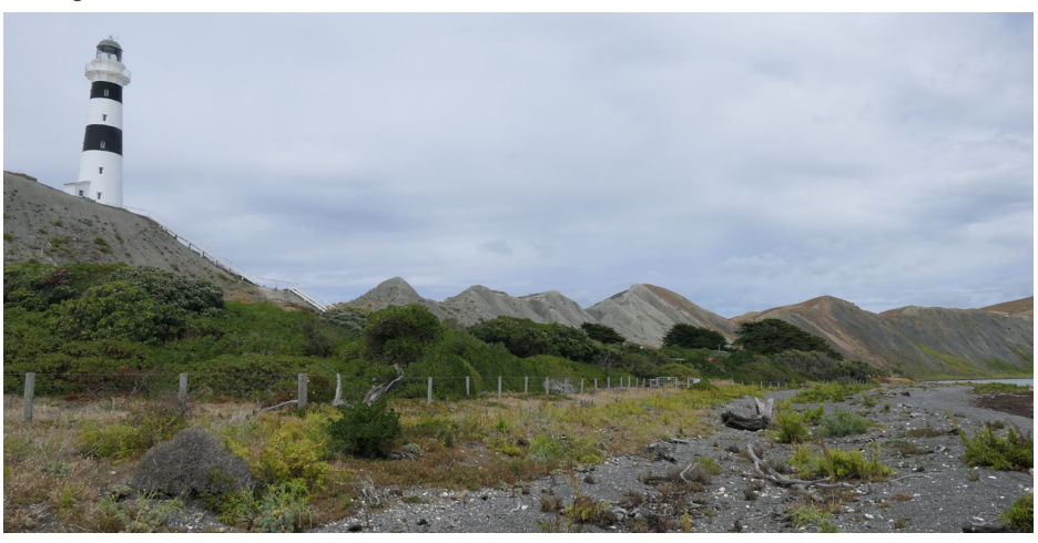
Cape Campbell lighthouse and beach