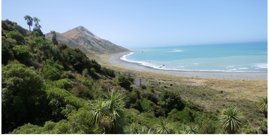
Looking north towards Cape Campbell