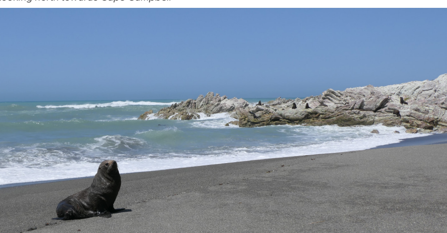
Seals near The Needles