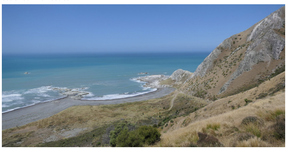
Looking down on The Needles