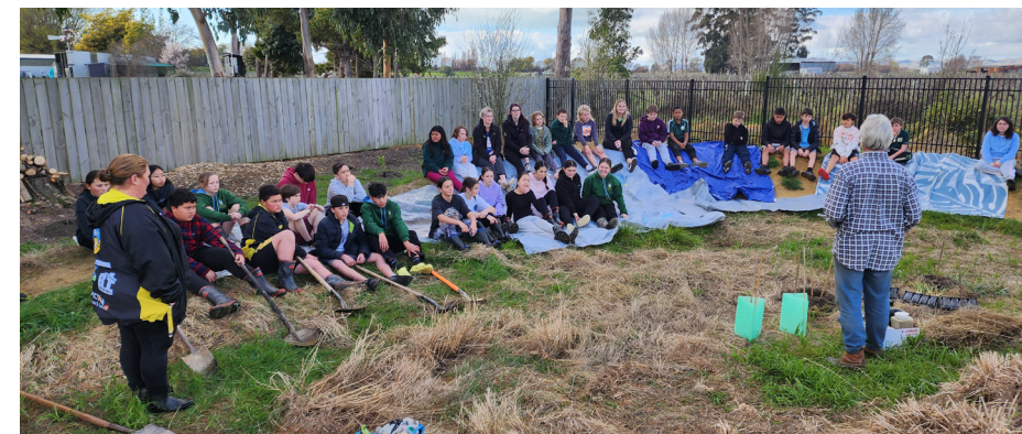
Hinepango Wetland Restoration largely runs on volunteers and has received multiple rounds of funding for various stages of protecting and enhancing this significant wetland

The next round of funding for the 2025-2026 grants will open on 1 April 2025. Go to: www.marlborough.govt.nz for a full list of this year's grant recipients.