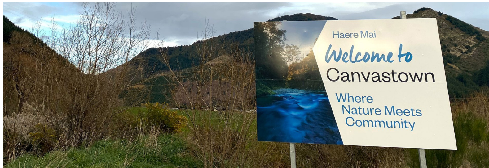
The new gateway signs for Canvastown/Whakamarino

The name Canvastown acknowledges the many pitched tents that dotted the area in the 1860s.