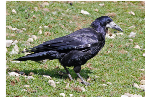
Don't shoot at rooks - it can make them harder to control

If birds were looking to make their way here, then they would likely do so in spring when they want to nest, Liam said. If you think you've seen a rook, contact Council's biosecurity team at biosecurity@marlborough.govt.nz or Ph: 03 520 7400.