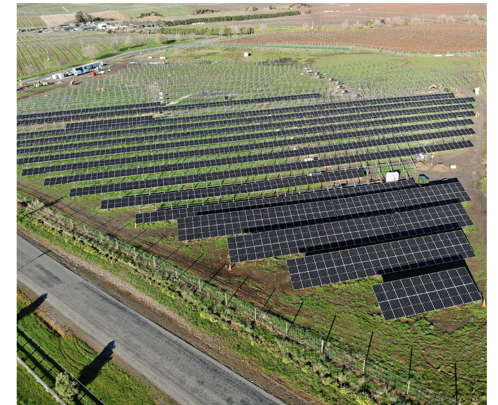
Marlborough Lines' Seaview solar site under construction

For more information go to: www.cmea.org.nz