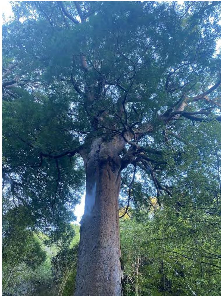
Figure 3: Tall matai tree in the Omaka Valley.

While fencing is important for some lowland sites within a pastoral farming landscape, feral animal pest control is the main challenge in North Marlborough, especially as there are still populations of a range of native fauna present (forest birds, sea birds, weka, giant land snails, and native freshwater fish species).