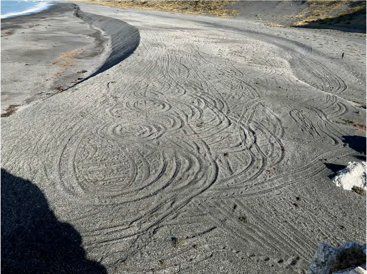
Figure 7: Multiple vehicle tracks at the racetrack turnaround point at Needles Point.