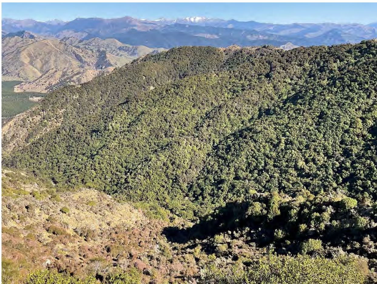
Figure 2: Covenanted SNA surveyed in the Tummil.

Thirteen new sites measuring a total of 694ha were added to the database this year. They were on 12 properties in Waihopai (5), Flaxbourne, Kekerengu, Para (3), Pelorus (2) and Sounds Ecological Districts. They range from beech and podocarp forest to coastal broadleaf and wetlands.