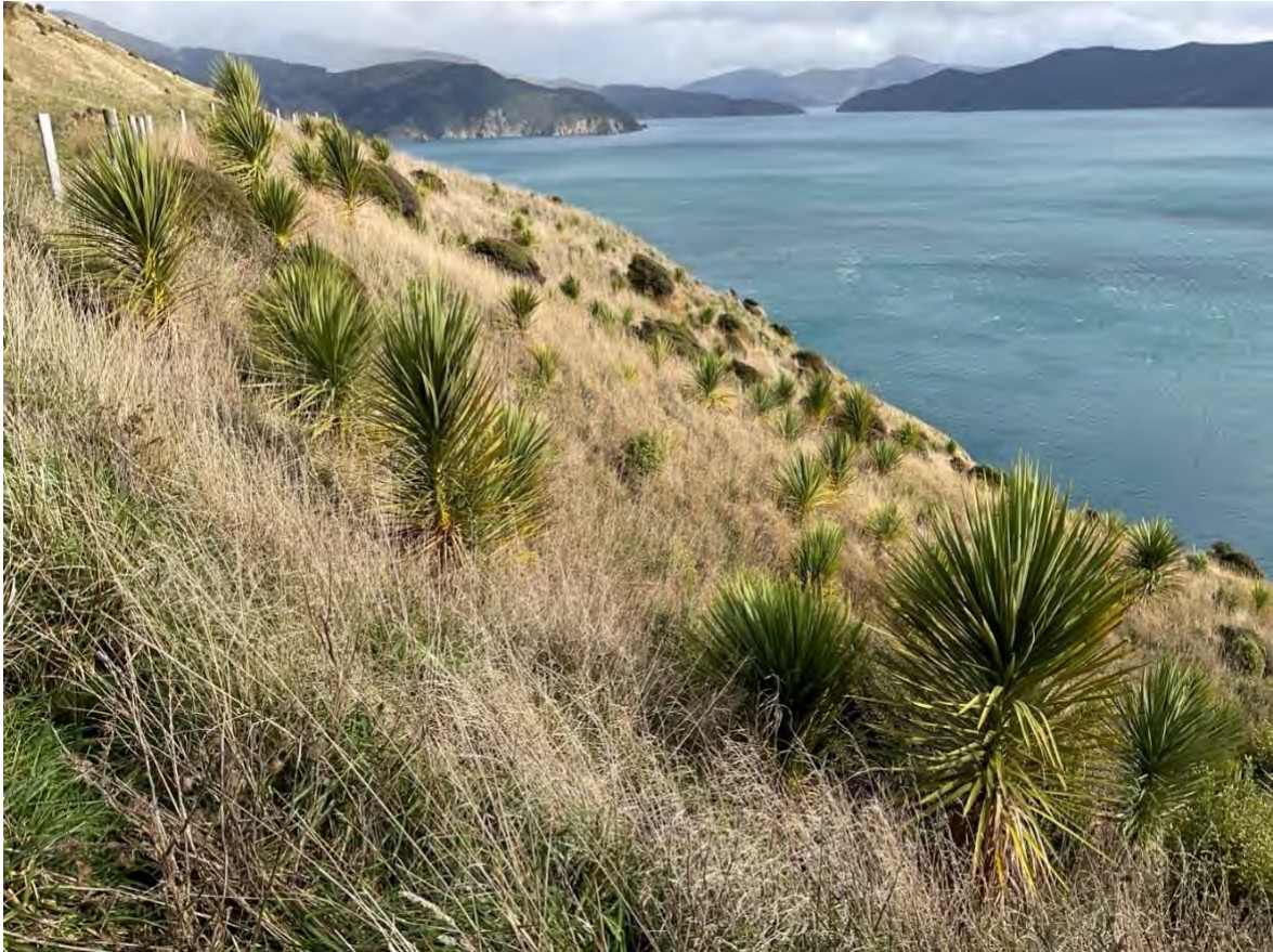
Figure 5: Revegetation project on steep coastal faces at Waitui Farm. Afterwards.