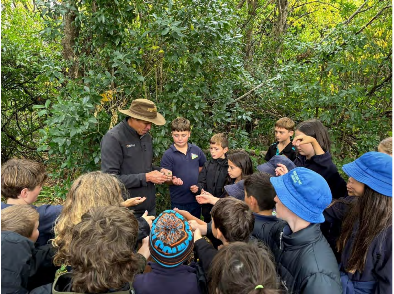
Figure 8: Waikawa Bay students eager to learn, EOTC.