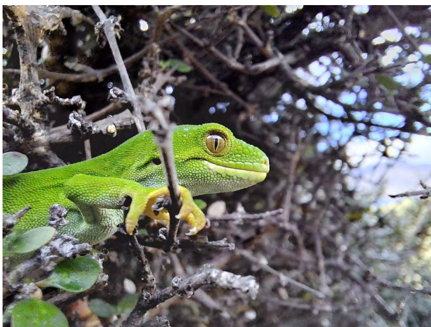
Figure 11: Marlborough Green Gecko

In summary, the Significant Natural Areas Project continues to be the main avenue for Council to protect land based indigenous biodiversity in the Marlborough region. Marlborough has less than 5% of its rarer ecosystem types remaining on the plains, which is not enough to sustain biodiversity on the plains over time. With Primary Industry being such an important part of the Marlborough economy, Council has a critical role in working with the community to help ensure that the natural environment is not degraded, and hopefully is improved.