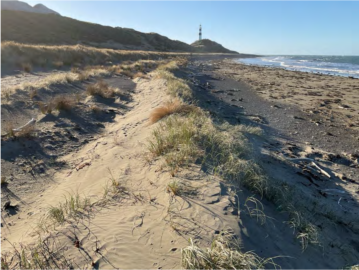
Figure 9: Dune building processes at Cape Campbell started by planting spinifex.