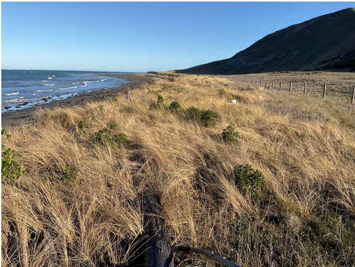
Figure 10: Ngaio trees emerging through the marram grass.