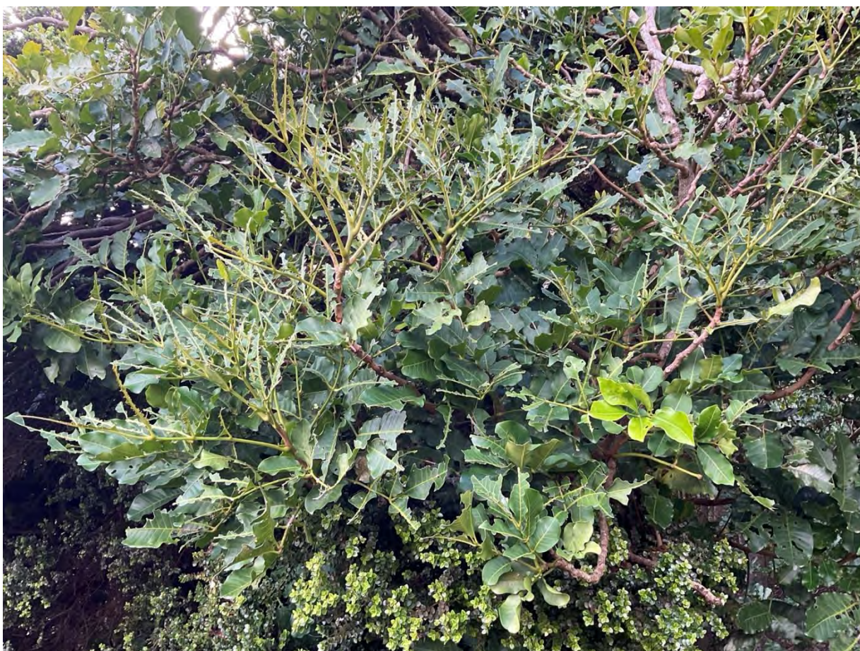
Figure 6: Possum browse on kohekohe leaves.

Systematic monitoring was established to assess the condition of the 167 sites that have been actively managed through the Landowner Assistance Programme since 2006 (about 13% of all sites identified). In 2024, 25 managed sites were monitored and found to be in fair or good condition with an ongoing trend of stable or improving. Not unsurprisingly, managed sites are in better condition than unmanaged sites.