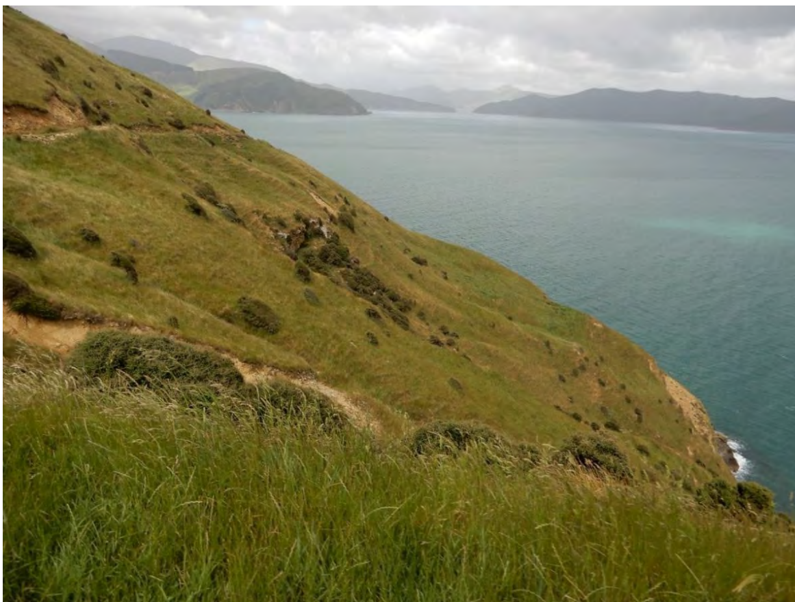
Figure 4: Revegetation project on steep coastal faces at Waitui Farm. Before.

A summary of all Significant Natural Area project expenditure is included in Appendix 1.