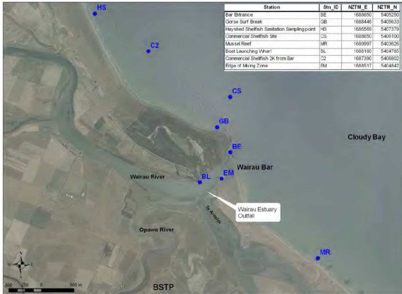
Figure 6.1: Site Locations Used for Quantitative Microbial Risk Assessment (NIWA,2007)