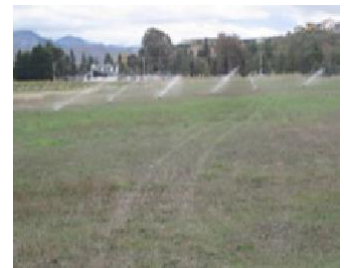
Well monitored application