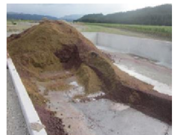
Sealed storage area with leachate collection