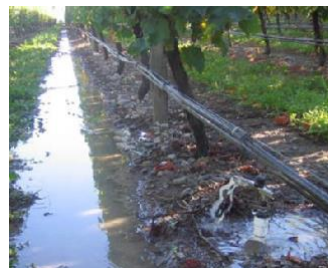
Overwatering causing ponding