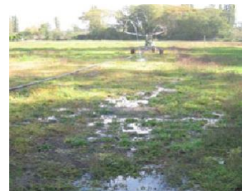
Overwatering causing ponding