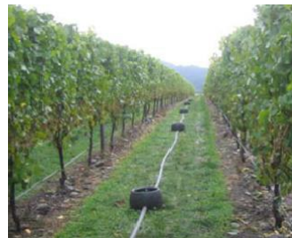
Low rate application system