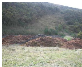
Grape marc stored to land with no leachate collection