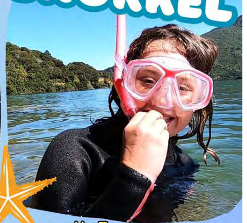
with Experiencing Marine Reserves